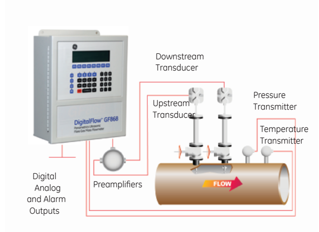
Typical meter set-up for standard volumetric or hydrocarbon mass flow

and does not interfere with the flow in any way. All-metal ultrasonic transducers installed in the pipe send sound pulses upstream and downstream through the gas. From the difference in these transit times between the transducers, with and against the flow, the DigitalFlow GF868's onboard computer uses advanced signal processing and correlation detection to calculate velocity, and volumetric and mass flow rate. Temperature and pressure inputs enable the meter to calculate standard volumetric flow. For maximum accuracy, use the two-channel version and measure along two different paths at the same location. The two-channel meter can also measure the flow in two separate pipes or at two different places on the same pipe.